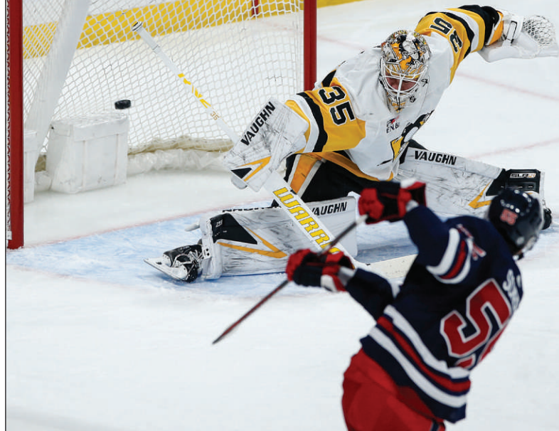
Winnipeg's Mark Scheifele scores past Penguins goaltender Tristan Jarry during the first period Saturday.

Pulling up on the right half-wall of the offensive zone, Guentzel forced an ill-conceived pass to the left point intended for Penguins defenseman Ryan Graves. Jets forward Nikolaj Ehlers was stationed in front of Graves and accepted Guentzel's charity, then initiated a two-on-one rush with Scheifele against Penguins defenseman Erik Karlsson. After gaining the Penguins' zone on the right wing, Ehlers dished a cross-ice