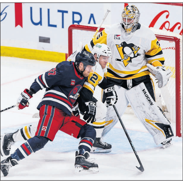
The Penguins' Chad Ruhwedel defends against Winnipeg's Nikolaj Ehlers in front of goaltender Tristan Jarry during the second period.