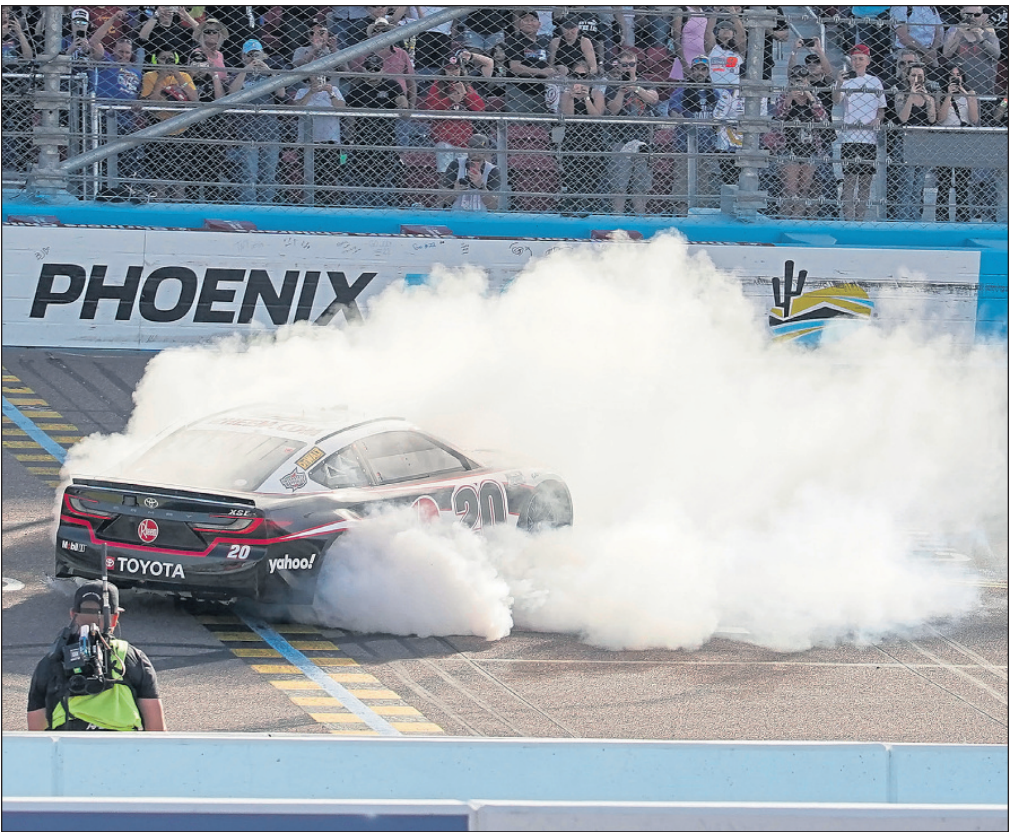
Christopher Bell does a burnout after his win Sunday at Phoenix Raceway.