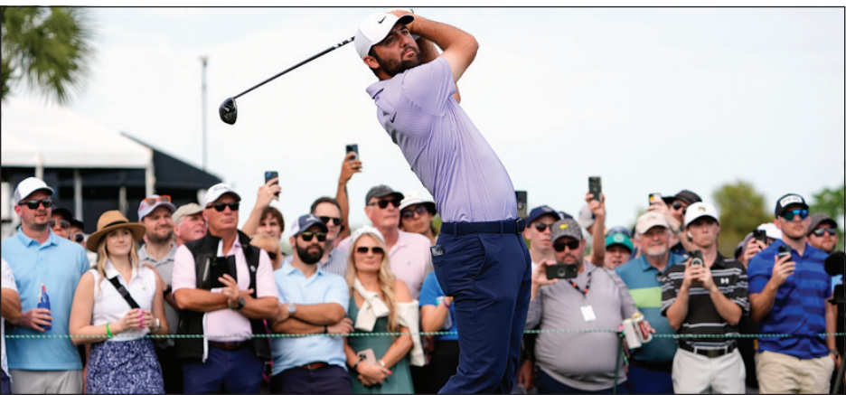
Scottie Scheffler tees off at the 15th hole during the final round of the Arnold Palmer Invitational.